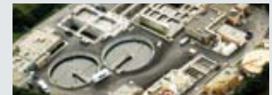
Sewer Authority Wastewater Treatment

Delivered stable filtrate to ultrafiltration with Zero fouling and backwash.