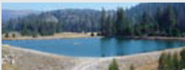
Bear Valley Water District Secondary Wastewater

Reduced turbidity up to 70% and at half the cost of Dissolved Air Flotation.