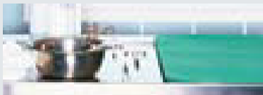
Oil & Gas Exploration Co. Produced Water

Outperformed other technologies while retaining 50% water recovery.