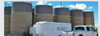
Oil & Gas Exploration Co. Produced Water

Outperformed other technologies while retaining 99.5% water recovery.