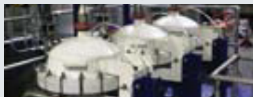
Meat Processing Plant Industrial Wastewater

Reduced bag filter changes by 80% and helped avoid additional capital expenses.